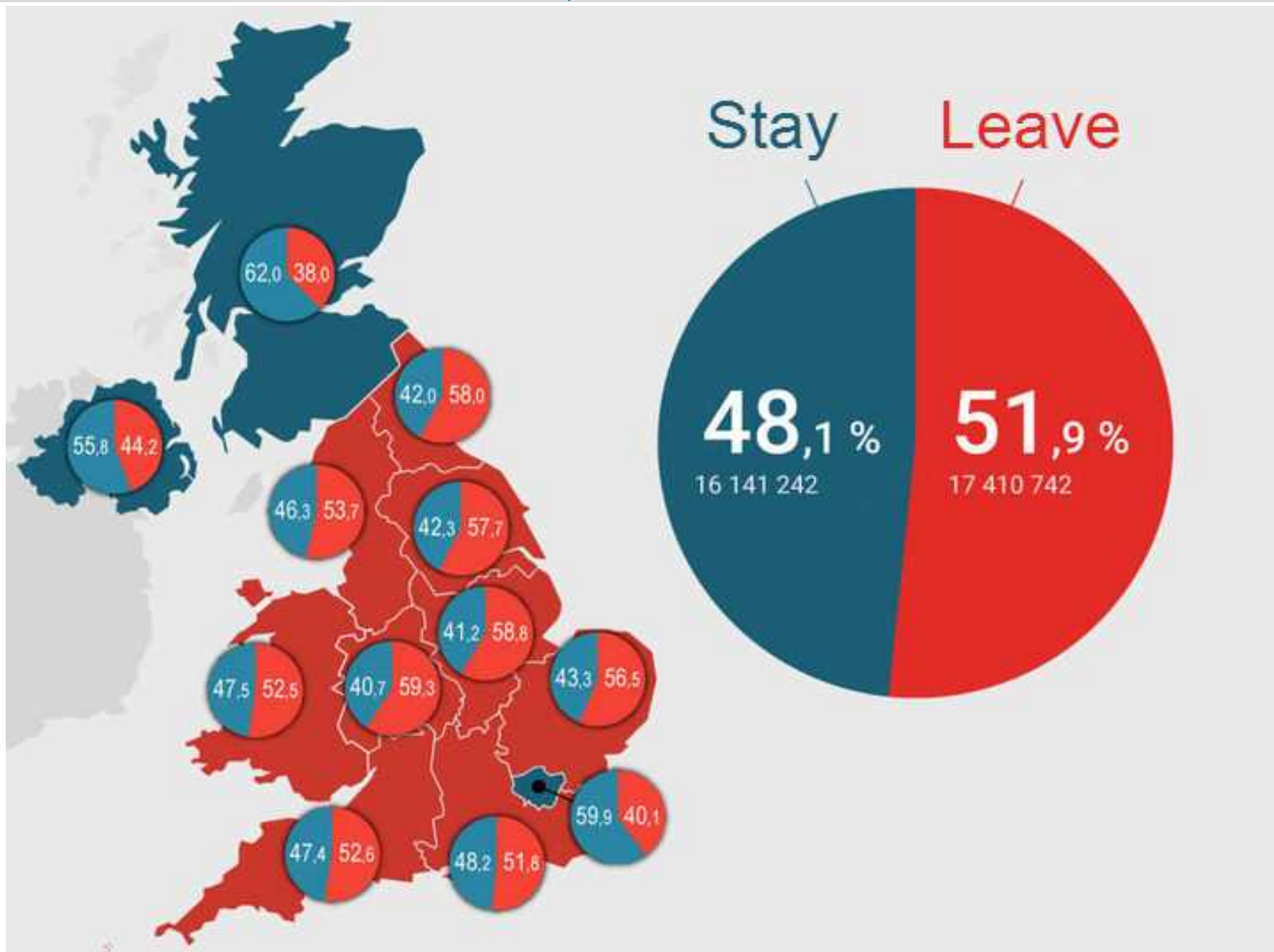
Graph 2: Brexit referendum 2